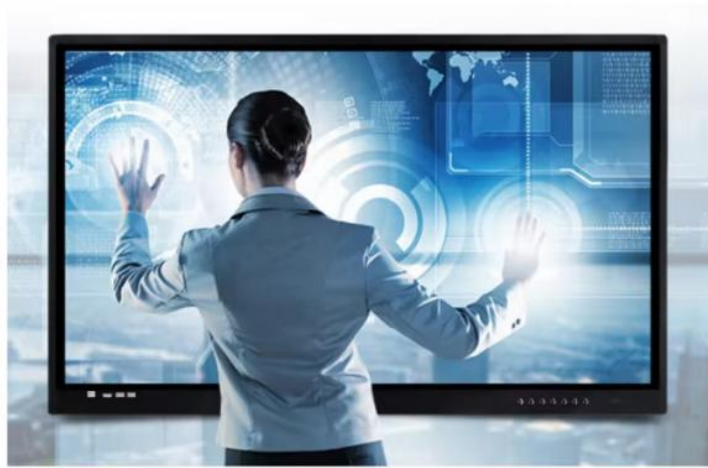
Multiple gestures intelligent touch