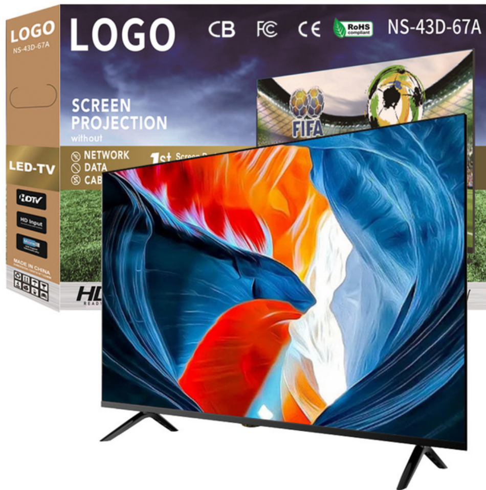
Slim bezel design