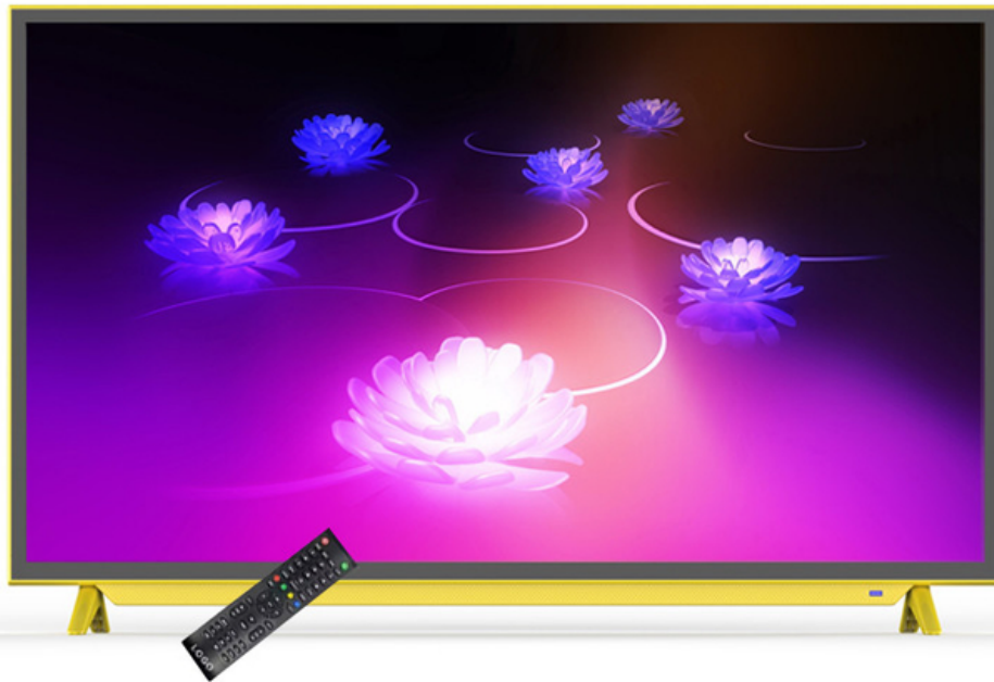
Vibrant 4K display