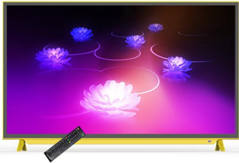
Android TV interface