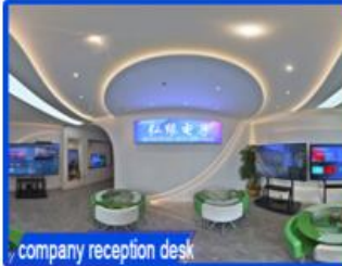
company reception desk