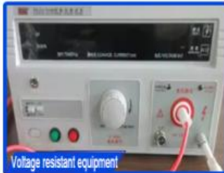
Voltage resistant equipment