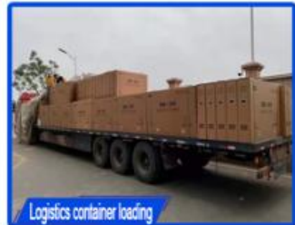
Logistics container loading