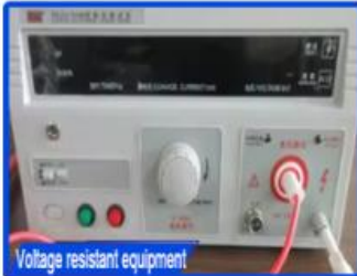
Voltage resistant equipment