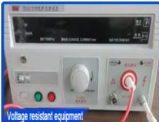
Voltage resistant equipment