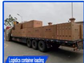
Logistics container loading