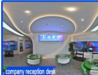
company reception desk