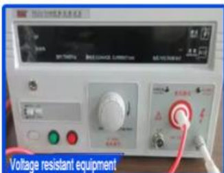
Voltage resistant equipment