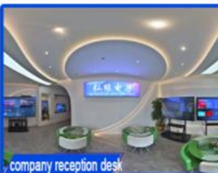
company reception desk