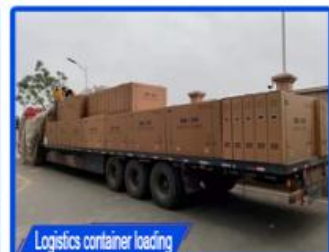
Logistics container loading