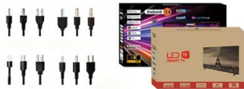
Kraft Paper/ Colorful Carton (Customize)