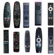
Remote Control Normal/ Voice (Customize)