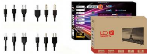
Kraft Paper/ Colorful Carton (Customize)