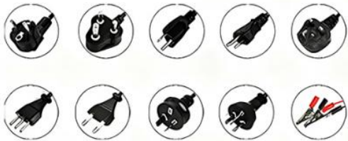
Plug Category Customize