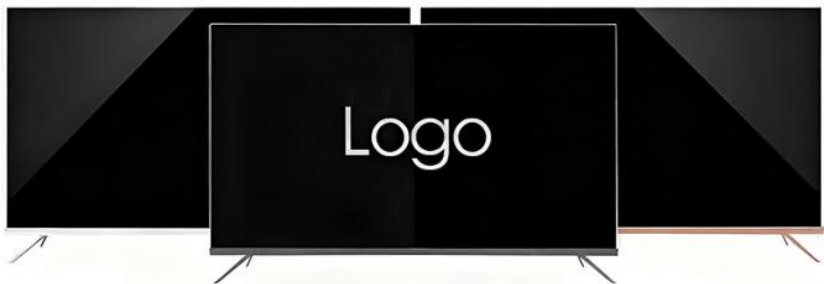
Custom Mold Frame/ Legs Color (Black or Optional)