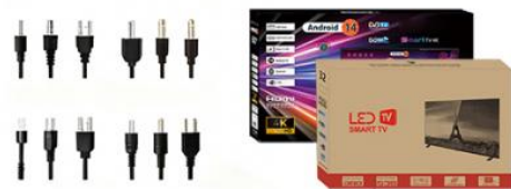
Kraft Paper/ Colorful Carton (Customize)