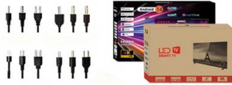
Kraft Paper/ Colorful Carton (Customize)